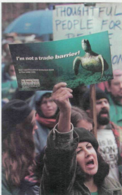
Demonstrators protesting the 1999 WTO meetings in Seattle were concerned that the international shrimp trade was harming sea turtles.

Despite the potential for such win-win situations, pro-environment critics worry that WTO could undermine the Kyoto Protocol, while free-trade proponents fear that Kyoto could challenge WTO. The specific sort of legal conflict that is likely to come up is the adoption, as part of a country's climate change policy, of tariffs or other measures that discriminate against producers in certain